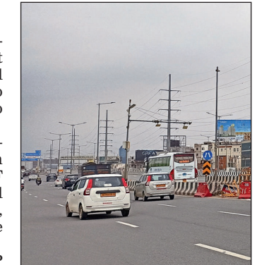
The picket will come up near

95 personnel at the terminal, plans to add 21 more men to conduct the first-level security check at the picket. The terminal will get 11 personnel from the civil police too and more as the number of flights go up, Maurya said.