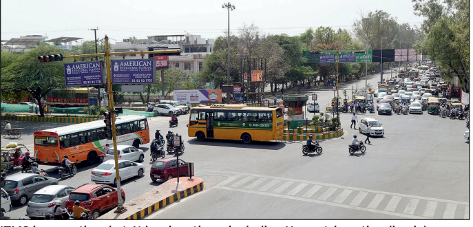
ITMS is operational at 41 key junctions, including Hapur tri-section (in pic)

The camera network will cover major arterial routes, including Hapur tri-junction to Mohan Nagar, Mohan Nagar to Seemapuri border, Tulsi Niketan to Nag Dwar,