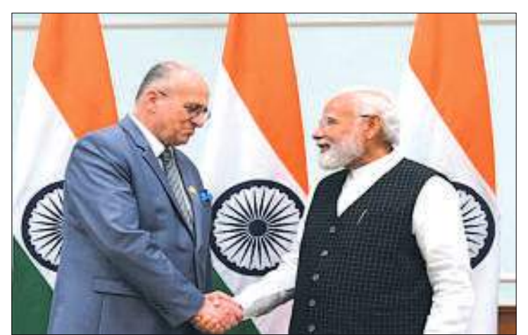
On the sidelines of Raisina Dialogue 2022, Prime Minister Narendra Modi met H.E. Zbigniew Rau, Hon'ble FM of Poland

In 1954 Poland and India established diplomatic relations. During next decade many Polish engineers participated in many projects across India, there was also cooperation in many other fields. In 1989 Poland liberated itself from Soviet Russian domination, terminated the criminal communist system and