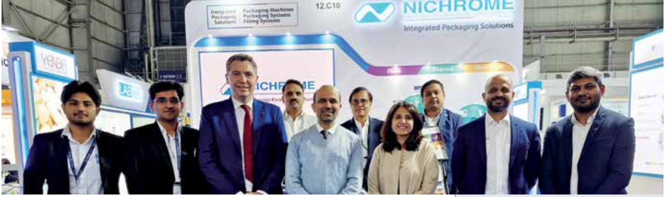
Team Nichrome at CPHI and PMEC 2023.

any machine. We wanted to have an open discussion with visitors about their problems and possible solutions,” he said.