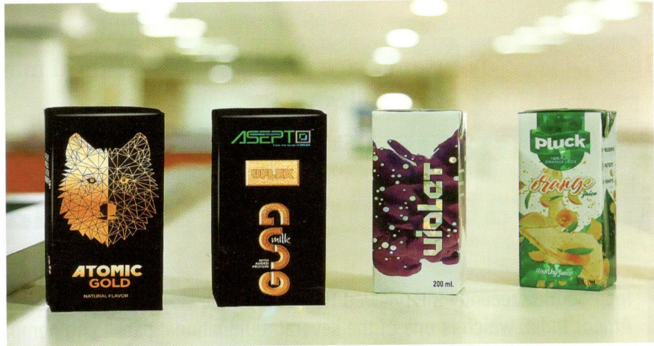
Asepto's 200 milliliter aseptic liquid packaging with holographic and metallic decoration.

around 20% of the domestic market share in less than four years, which has resulted in our existing full capacity utilization. The doubling of our Sanand plant's production capacity is lined up next and should be rolled out soon. This step will be a great achievement considering we have almost set up the line when the global economy has not yet recovered completely from the unprecedented stress caused by the Covid-19 crisis and has been cautious about expansions.