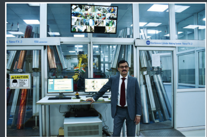
A visit to UFlex Cylinders Business