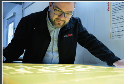
Lorytex strikes packaging gold with flexo and ECG