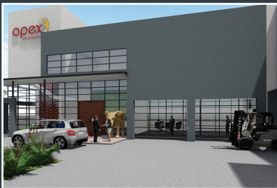
Apex International launches FlexoKITE in India