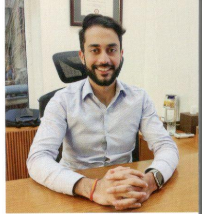
TCPL Packaging's flexibles division poised for strong growth p14