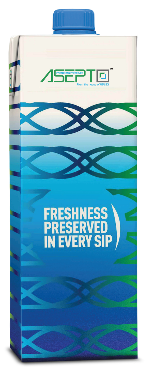
Asepto is a new segment for Uflex

Uflex bagged this year's Packaging Company of the Year Award. Uflex won the accolade on the basis of a solid financial performance. The company's gross sales and profit before tax also increased. In the converter division, the Uflex team has been specialising with 3D and 4D pouches with re-closable options, as well as wicketed bags for baby and hygiene markets with handle, pet food pinch bottom bags, cement block bottom bags, flexitubes, lids, confectionery foils, embossed foils, hygiene films, inno-lok pouches, pocket PTC zipper, spot embossing, electron beam curing, and cast and cure technologies.