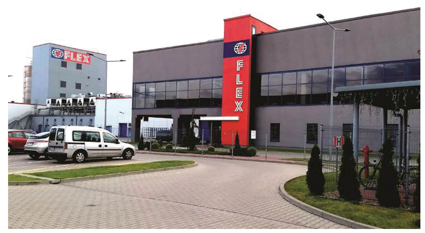
Uflex's plant in Poland