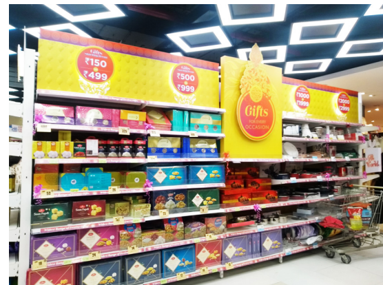
Diwali gift aisle at the Big Bazaar supermarket at Mall of India in Noida.

Covid-19 had brought various industries to a halt and impacted the global econ-