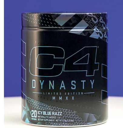
AWA Sleeve Labeling Award winners 2020