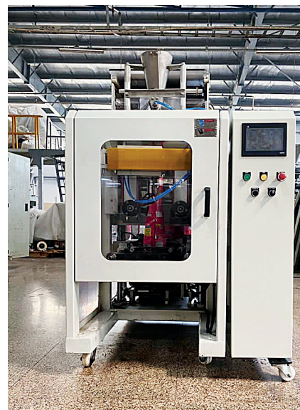
UFlex's higher speed Collar Type Form Fill & Seal machine CT 120 is a completely servo driven vacuum pulling, smooth-motion cross and vertical seal technology that delivers superior quality seal with high seal integrity. At a speed of 120 PPM with a very low rate of on-line rejections on snack packaging applications, this is the first Indian continuous type VFFS machine running at this high speed with minimal rejection.