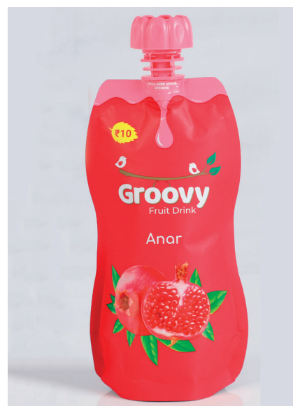
UFlex has come up with new shapes for pouches with reclosable closures and caps.