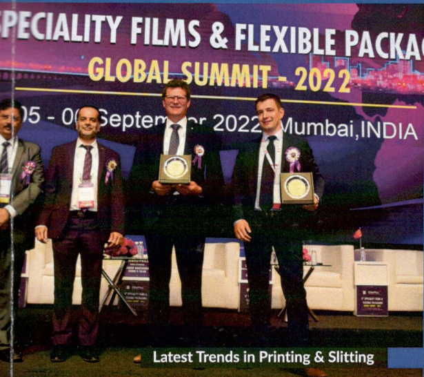
Latest Trends in Printing & Slitting