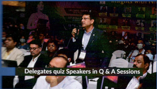
Delegates quiz Speakers in Q & A Sessions