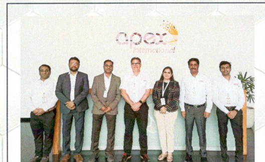
Apex International hosts FlexoKITE