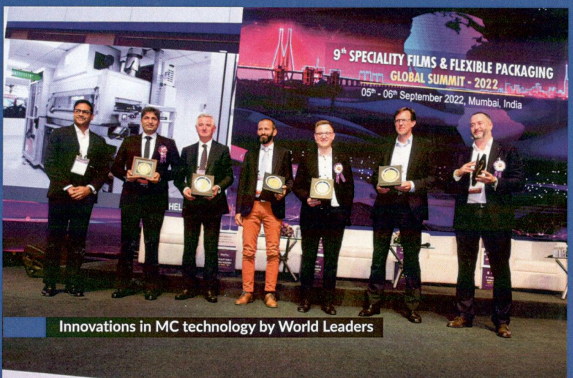
Innovations in MC technology by World Leaders