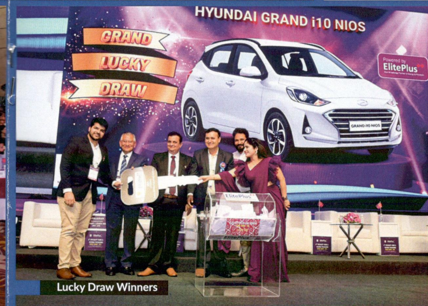
Lucky Draw Winners