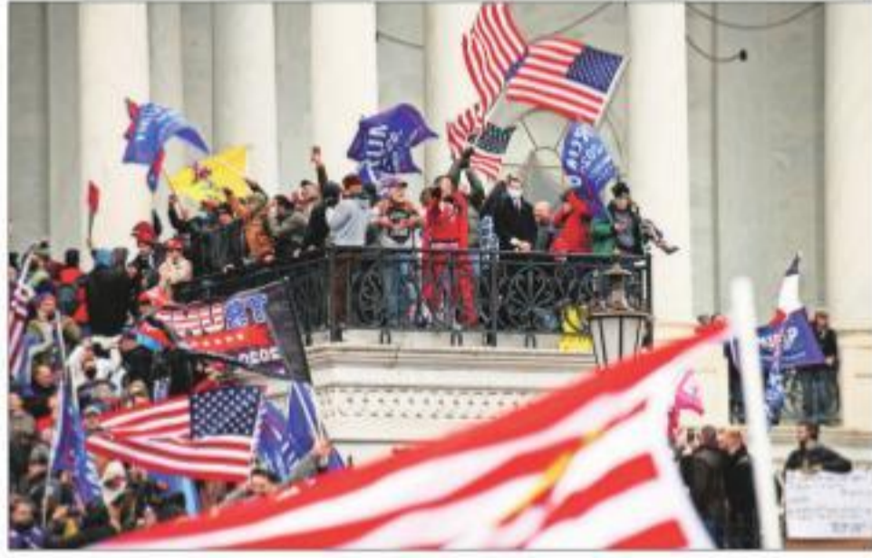
Previously unseen videos showed the view from inside the Capitol as rioters fought with police

House managers prosecuting the case frequently highlighted the threat to Pence. Trump had repeatedly said Pence had the power to stop the certification of the election results, even though he did not.