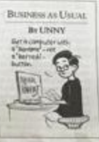
FULL COVERAGE PAGES 4-5

"We obviously want to showcase our technological platform to set us apart in the Global South, but we also want the developed countries to take a look at them," a senior official from the Reserve Bank of India (RBI) said. "We want to show CONTINUED ON PAGE 2