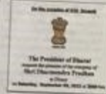
The President of Bharat (below) and Prime Minister Narendra Modi (right) at the official note on the visit to Indonesia for the ASEAN and East Asia meets