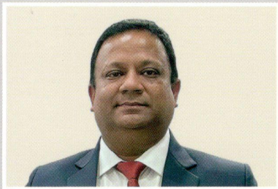
Domino India promotes sustainability with coding automation