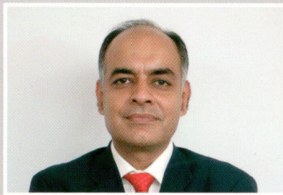
Cosmo Films commissions BOPET line for specialty PET films